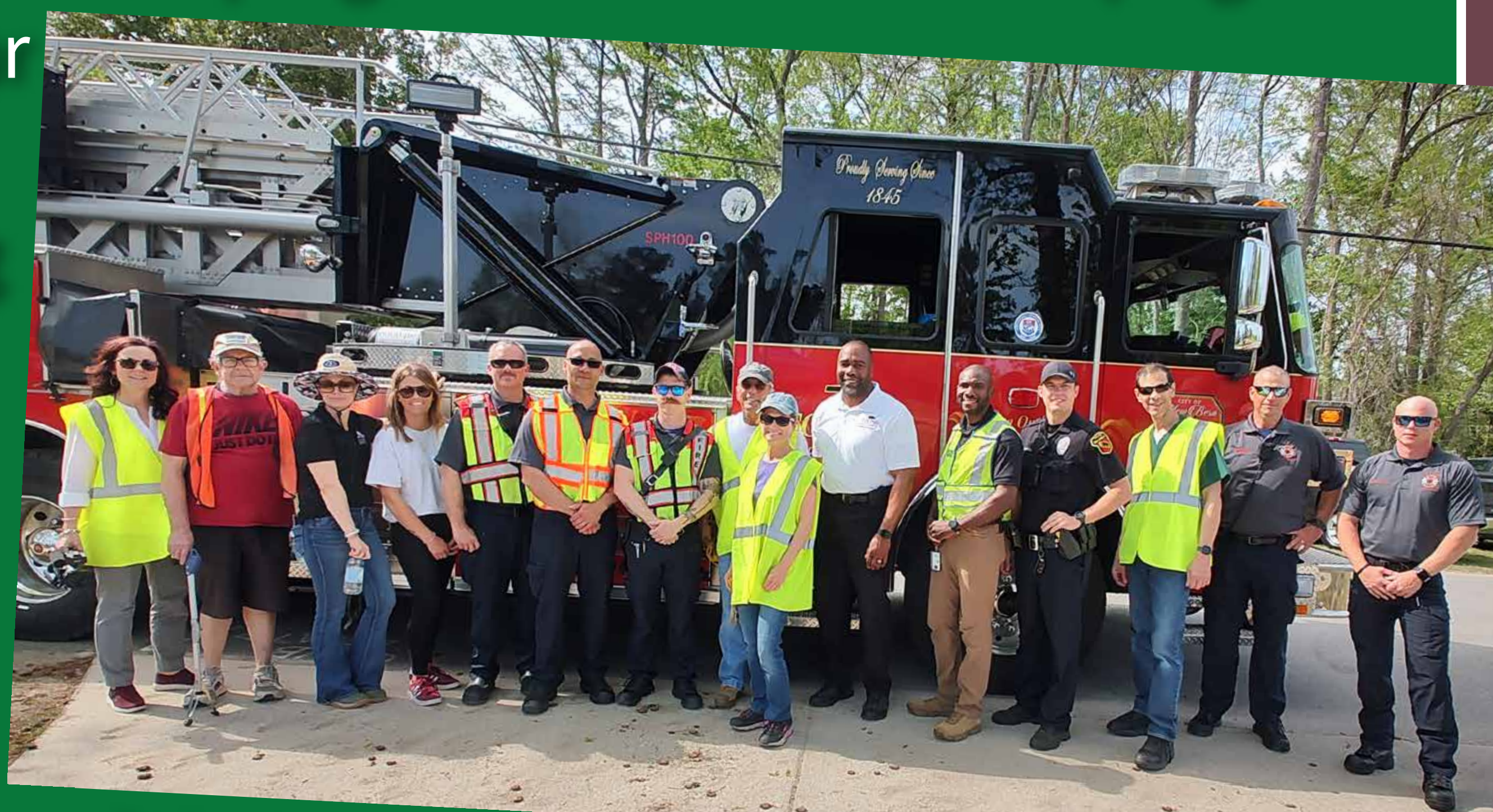
Oaks Road Community Cleanup April 10

Meet us at Emmanuel Fellowship Church (1200 River Rd) as we "Keep New Bern Clean" on Thursday, May 9 along River Road. We'll gather for a safety brief, then grab safety vests, bags, gloves & trash pickers for our litter cleanup. The "Keep New Bern Clean" program is an annual campaign to reduce litter in our community, encourage recycling & educate the public on proper trash disposal & how to care for our environment.